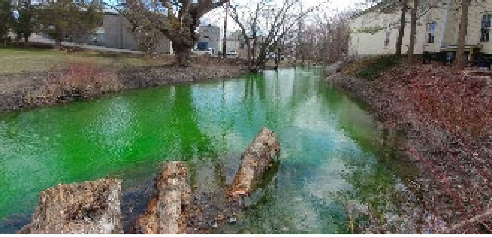
- My view from the Kelley Street Bridge that day